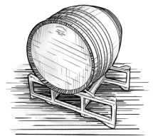
Aged in 32% new French oak