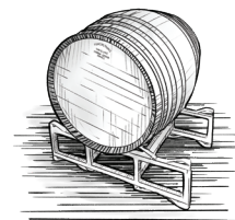
Aged in 42% new French oak