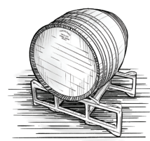
Aged in 100% new French oak