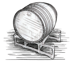
48% new French oak